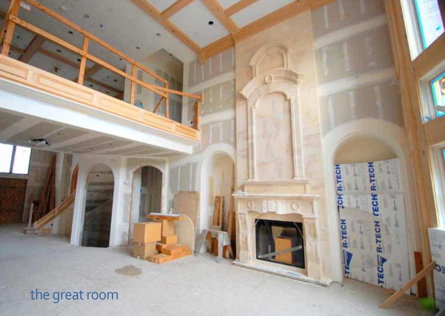
the great room